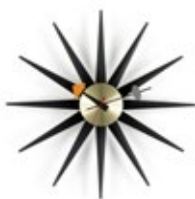
Sunburst Clock, black/brass, Ø 470