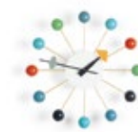
Ball Clock, multicoloured, Ø 330