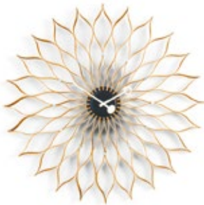
Sunflower Clock, birch, Ø 750