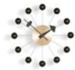
Ball Clock, black/brass, Ø 330