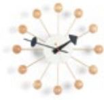
Ball Clock, beech, Ø 330