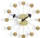
Ball Clock, cherry, Ø 330