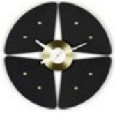
Petal Clock, black/brass, Ø 448