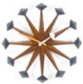
Polygon Clock, walnut, Ø 430