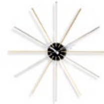
Star Clock, chrome/brass, Ø 610