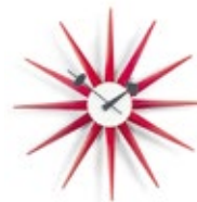
Sunburst Clock, red, Ø 470