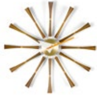
Spindle Clock, aluminium, solid walnut, Ø 577