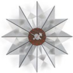
Flock of Butterflies, aluminium, Ø 610