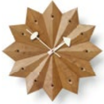
Fan Clock, Kirschbaum (USA), Ø 384