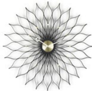
Sunflower Clock, black ash/brass, Ø 750