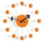
Ball Clock, orange, Ø 330