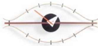
Eye Clock, brass/walnut, H 340 x W 760