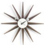
Sunburst Clock, walnut, Ø 470