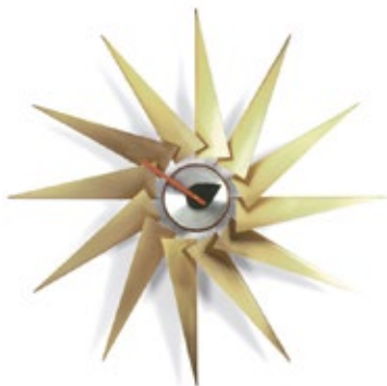
Turbine Clock, brass/aluminium, Ø 765