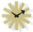
Asterisk Clock, Messing, Ø 250