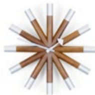
Wheel Clock, walnut/aluminium, Ø 455