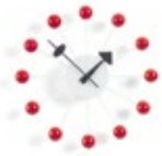
Ball Clock, red, Ø 330