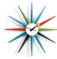
Sunburst Clock, multicoloured, Ø 470