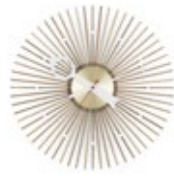
Popsicle Clock, Nussbaum, Ø 350